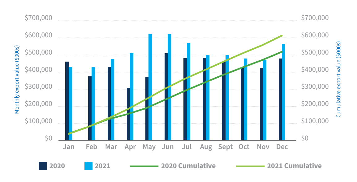
Figure 1. International Merchandise Export Value Nova Scotia International Merchandise Export Value, Last 24 Months

COVID-19 caused significant labour force dislocation and realignment in Nova Scotia and beyond. In November 2021, the province exceeded the pre-pandemic indicator for total employed for the first time. By January 2022, employment was 1.3% (+6,200) above the pre-COVID employment level of February 2020, continuing the growth trend since the easing of restrictions in May 2021.